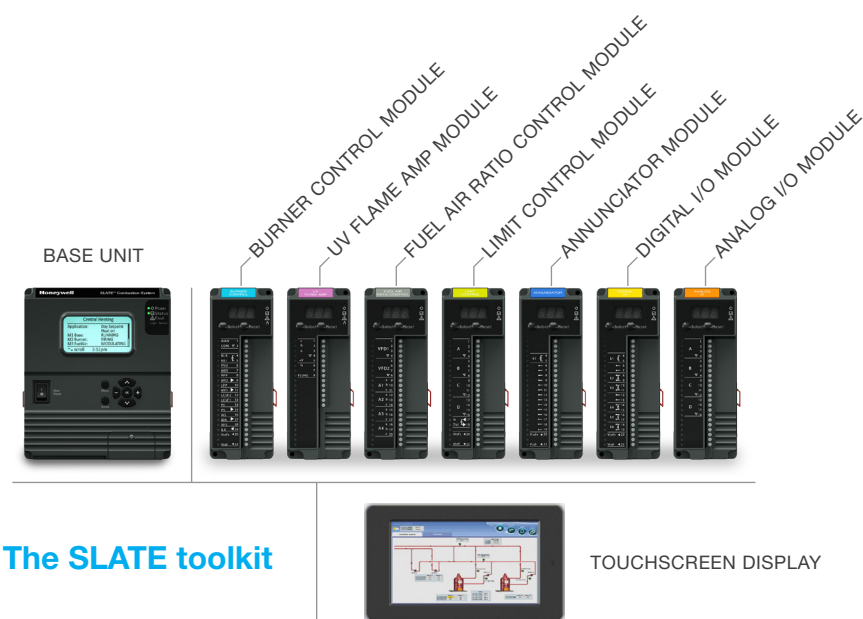
The SLATE toolkit

One platform from one vendor means significantly fewer products to source, purchase, stock and manage.